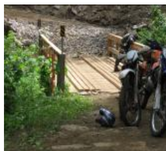
Below is QNM-11 Bridge Project located in Sherbrooke